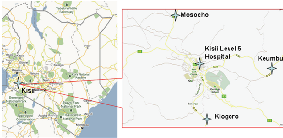
FIGURE 1: Map of Kenya showing Kisii, Nyanza Province, and inset showing the location of the three campaign sites and Kisii Level 5 Hospital (Kisii Town).

testing. HTC was provided on an “opt-in” basis and written consent was required for testing. Quality of HTC was insured by the use of certified counsellors, refresher training courses, a supervision system which employed one supervisor for every 10 counsellors, sending 1 out of 50 blood samples for reconfirmation with a different diagnostic method (PCR), and exit interviews by trained staff for all campaign participants. The exit interviews were used to assure quality and to improve services on a real-time basis.